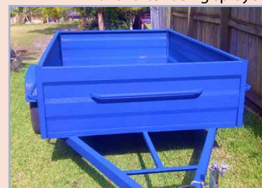
Trailer 9 months later